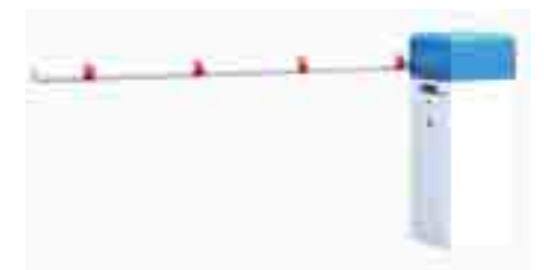
Vehicle Barrier with round tube arm