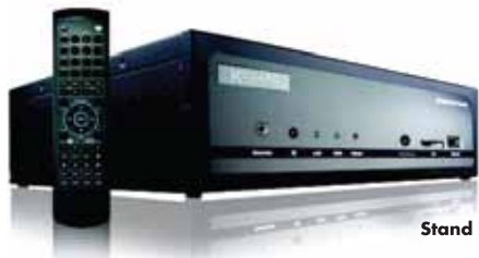
Stand Alone DVR System

Standalone are high-performance premium digital video recorders. It's stable & unique features make it outstanding at the same category. The SH-series are designed for the use in complex surveillance application. The KG-SH330/KG-SH530 offer the maximum storage capacity up to 8 terabytes (4 SATA HDD, each support up to 2TB). This professional series are also offering a variety of features including real-time video display, software upgrade from USB or remote site, USB DVD-RW backup, e-mail notification, NAS supported.